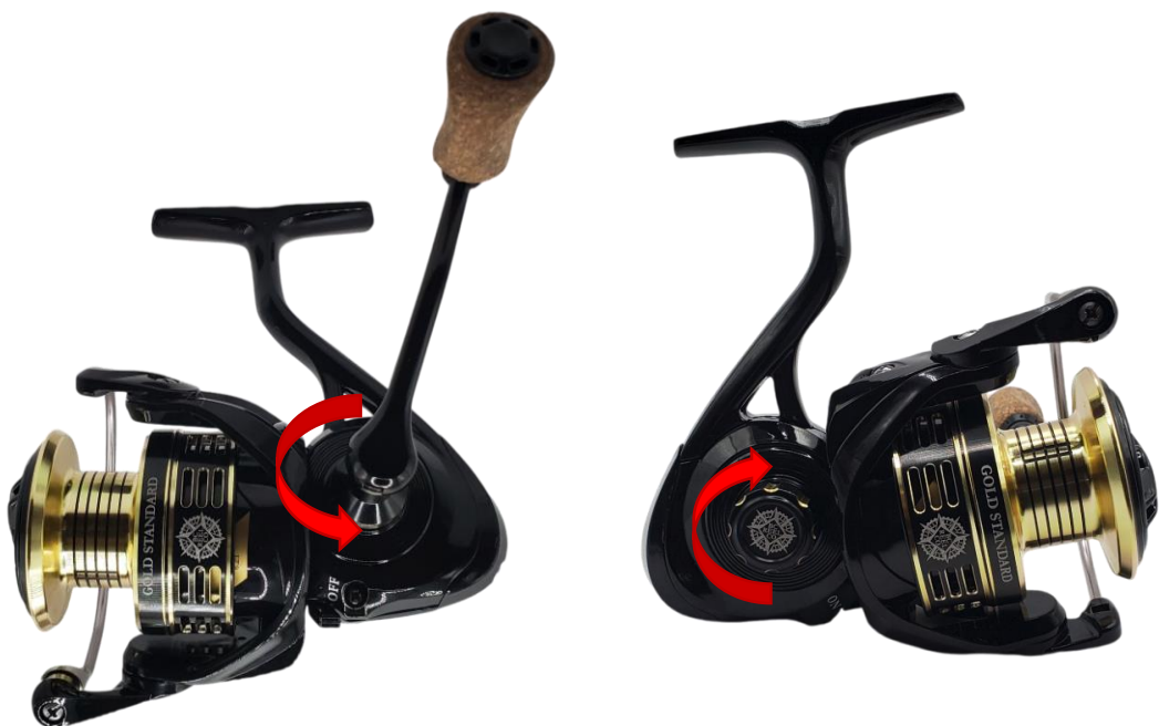
Figure 3: Handle and Cap Installation

The Gold Standard spinning reel is ambidextrous and the screw-in handle can be installed for left or right hand retrieve. First, hold the rotor to prevent it from turning while the handle is installed. For left hand retrieve, screw the handle into the left side of the reel counterclockwise until snug. For right hand retrieve, remove the cap from the right side of the reel and insert the handle threads. Screw the handle into the right side of the reel clockwise until snug. Do not overtighten. Install the cap on the opposite side from the handle by turning clockwise to tighten.